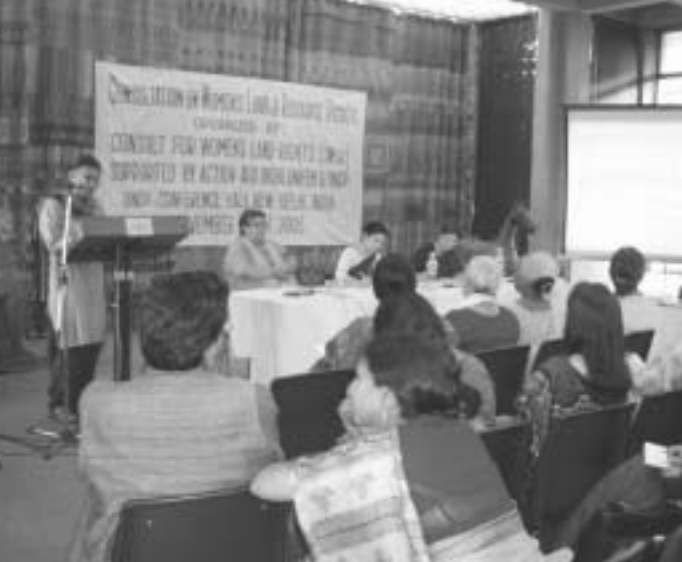
CWLR member presenting a paper on women and inheritance of forests and commons November, 2005

managed rather than owned and managed by private companies. The government grant for the land, building, and equipment of a women's Information Centre and salary for a trainer should be provided from a central government budget controlled by the Ministry of Women and Child Development. Drawing on central level budgets ensures that every state can begin developing woman information centres in spite of differing land laws between states.