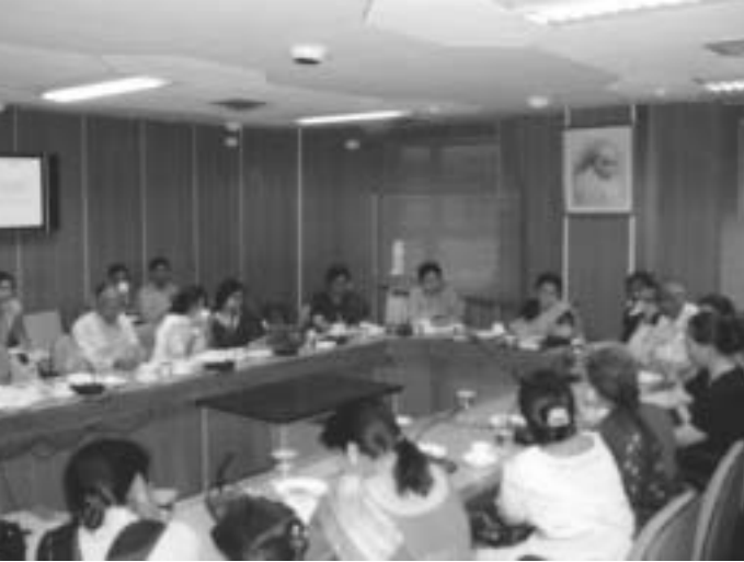
Member Planning Commission India invites CWLR to submit state level woman and land use proposals

and joint rights to land exist within the Indian constitution. Thus far rural women have struggled within the existing legal frameworks in to exact their rights to land by trying to attain individual titles, joint titles and group leases to land. The Working Group for Women and Land Ownership (GWLO) in Gujarat during September 2005 to January 2006 submitted to the government 212 applications for women's land ownership on private land, 911 individual applications for ownership in public land and 17 applications on public land for collective ownership of land to women's group. The network in a period of five months was successful in the sanction of land in women's name in 10 cases utilising existing legal processes.