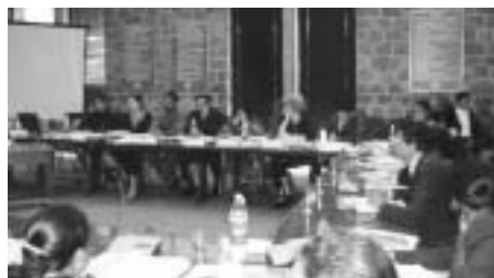
Participants agreeing to joint lobby initiatives at case study working group meeting, December 15, 2006

academics, policy analysts, government representatives, and rural women to come together in India and in countries where CWLR has members to foster a process of reform informed by the demands of rural women and supported by government and civil society.