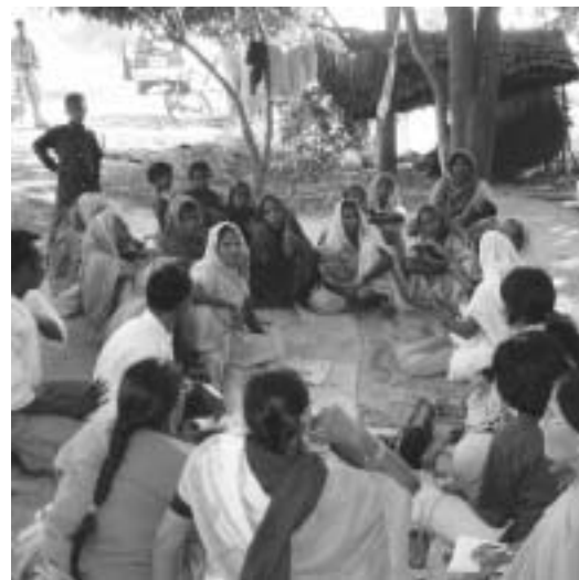
Discussing womens demands at the village meeting in Bihar

Many land rights movements and women’s groups have showcased