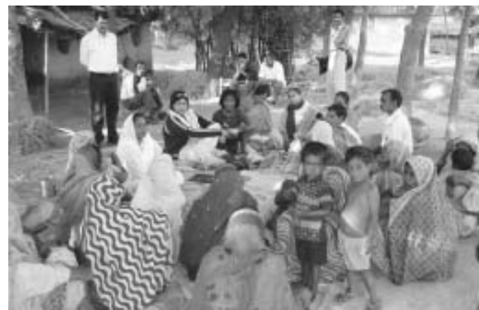
CWLR meeting at PANI in Sultanpur district Faizabad, U.P. during International Exposure Programme November, 2005

Land is being acquired more and more by multinational corporations, the political and social elite for purposes such as entertainment complexes, natural reserves, industry, tourism,