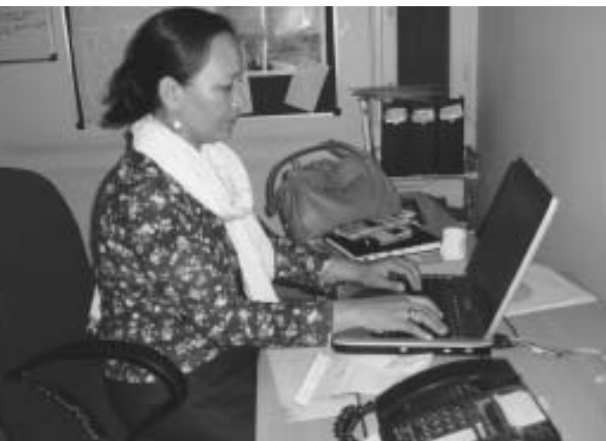
CWLR executive committee member adding lobby points for tribal women's land rights