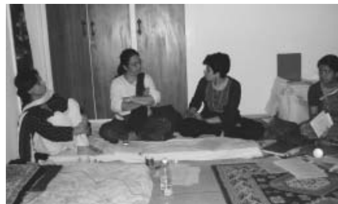
Meeting at CWLR Secretariat February 20-21, 2006 to firm strategy at ICARRD

The objective of land reform is to provide basic natural resources to the poor and to add supportive mechanisms to make smaller holdings viable through joint management. Currently individual