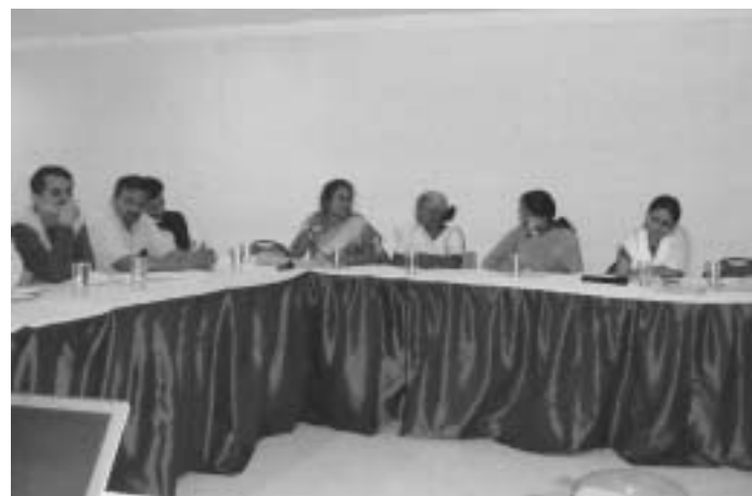
Consultation organized by Srijan Network U.P. November 18, 2005

rural women's rights to land and resources, which has increased visibility and interest on this issue. The Consult for Women and Land Rights among others has engaged different stake holders to discuss the options to create gender equality through allocation of land and resource rights for livelihood and homestead land. Organisations such as Action Aid, IGSSS, ICCO, HBF, UNIFEM, FAO, UNDP and IFAD are taking interest by supporting the development of