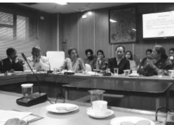
CWLR presenting a way forward at National Planning Commission India February 22, 2006

In 1995, a group of women formed their own co-operative and was leased 100 acres of fish ponds in Bihar for 10 years. The women converted the lake into a productive fish farm and earned a substantial income, however they face challenges in continuing their lease.