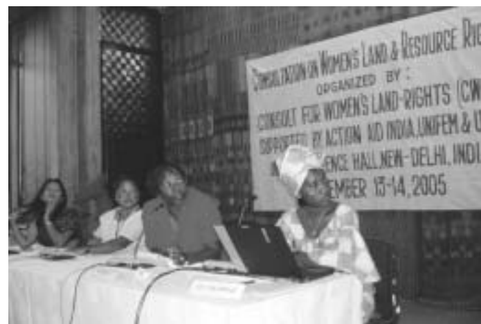
International delegation at consultation held in Delhi, November 13-14, 2005

The Government of India is encouraging the creation of knowledge and information centres in rural areas. These centres need to be women-owned and women-