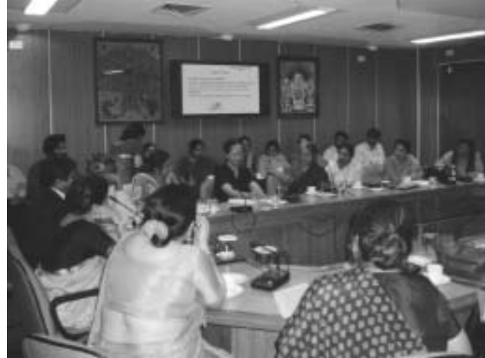
Discussion on tribal women's land rights at National Planning Commission February 22, 2006

The Private Forest Acquisition Act of 1975 empowers the government to acquire any forest land that may be owned by a private party. Although there are many conditions